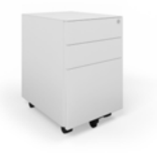
Mobile Box Box File

See Accessories for compete information.