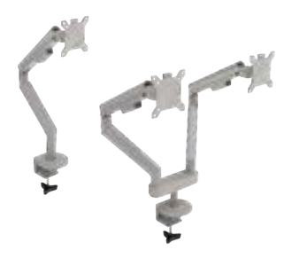
Single or Dual Montior Arms