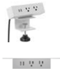
Clamp-on or Undermount Power