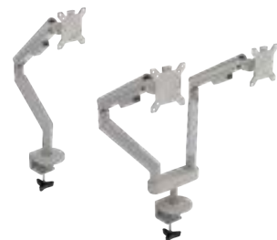
Single or Dual Monitor Arms