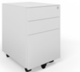
Mobile Box Box File

See Accessories for complete information.