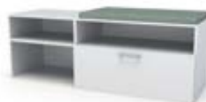
Low Credenza with Cushion