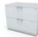
Lateral With Top