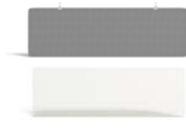
Modesty Panels in Mesh or Frosted Acrylic