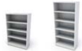
48" Bookcase 4 Shelves