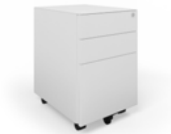
Mobile Box Box File

See Accessories pricer for complete information.