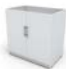
Storage Cabinet TS 29" H 1 Shelf