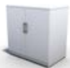
Storage Cabinet 29" H 1 Shelf