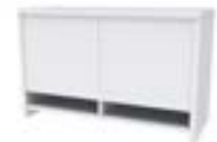
36" Overhead Cabinet