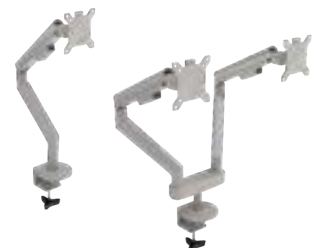
Single or Dual Monitor Arms