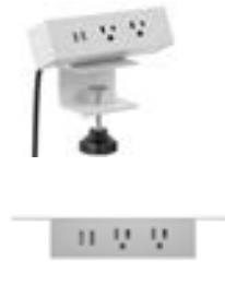
Clamp-on or Undermount Power