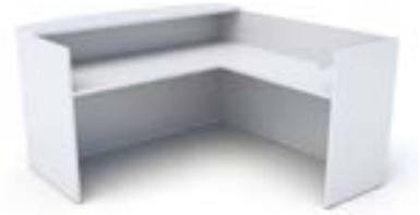
Reception Desk & Return