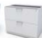
Lateral Top Supporting