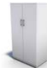
Storage Cabinet 66" H 5 Shelves