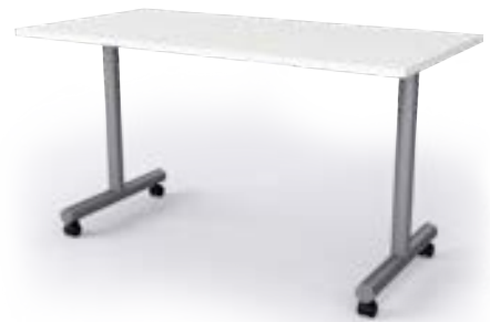
GEO T LEG, CASTER BASE, SILVER