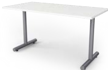
GEO T LEG, GLIDE BASE, SILVER