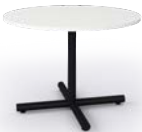
GEO X BASE, BLACK