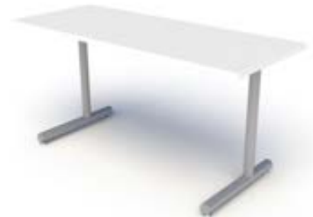
GEO C LEG, GLIDE BASE, SILVER