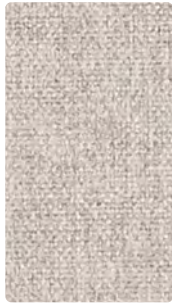
621-046 Light Grey